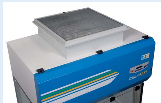
Additional filter housing re-circulating type